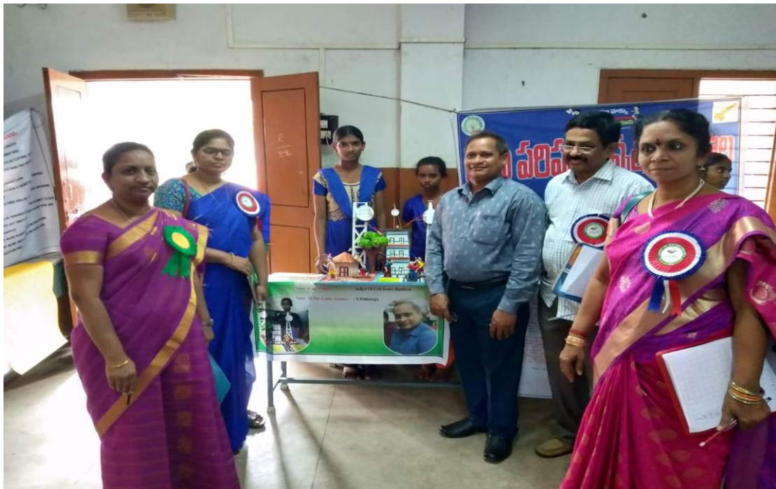
Jury members in INSPIRE Science exhibition observing Student projects