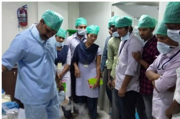
Students learning about IVF technique and Cryopreservation: Vizag IVF centre