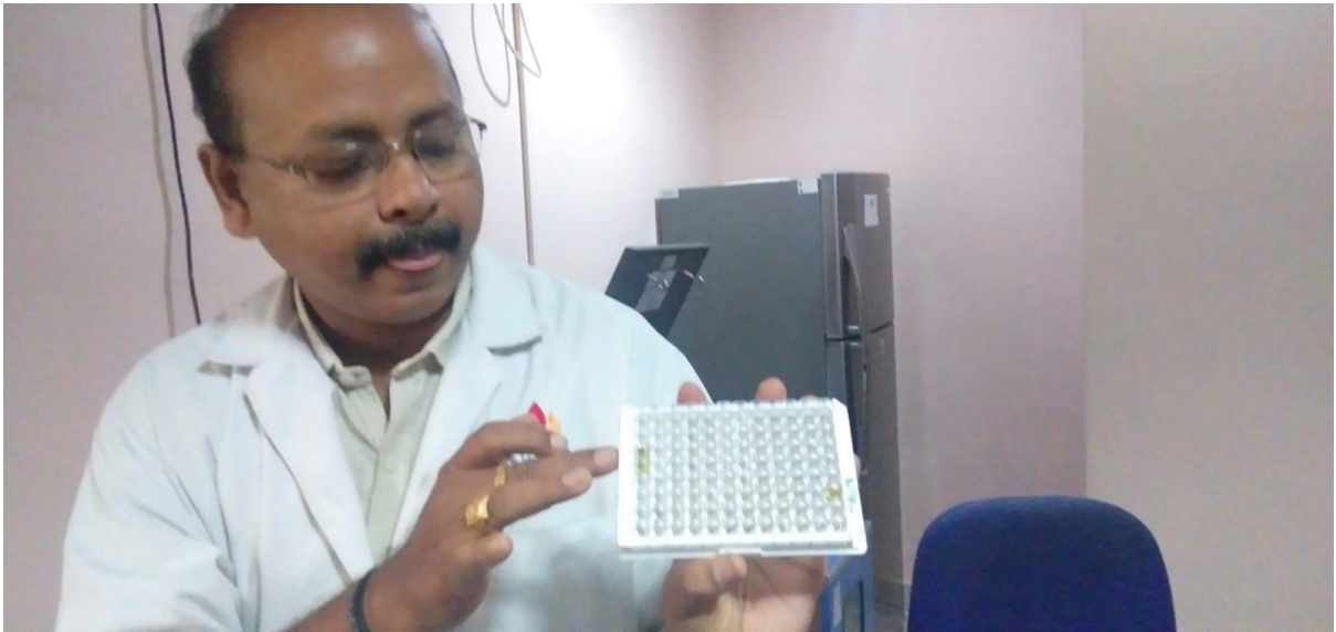
NTR Blood Bank Technician Showing the ELISA test kit to the students