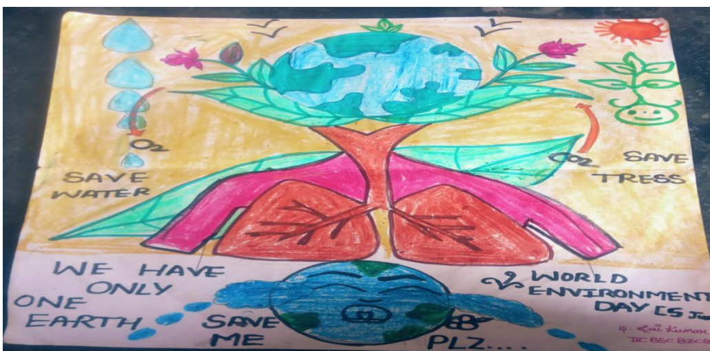
Posters on Environmental day prepared by students