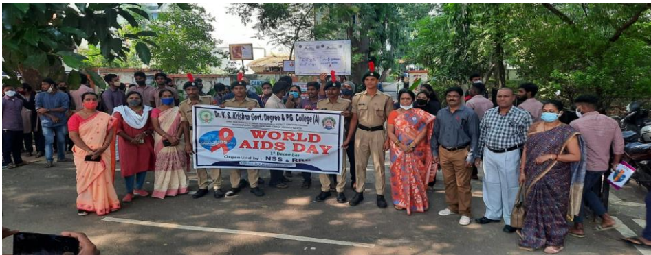
Department of Zoology staff and students along with NCC and NSS volunteers participated in AIDS RALLY December 2021