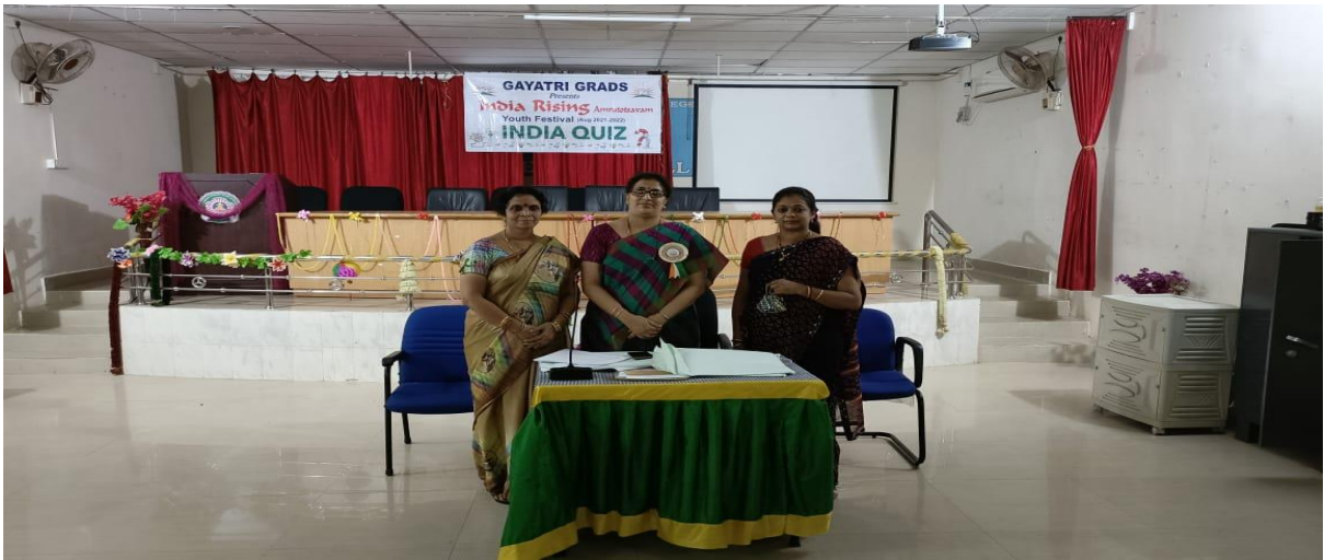
India quiz organised by GVP faculty and Dept of Zoology faculty