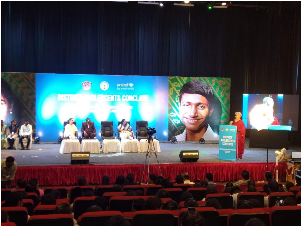
District Adolescent Conclave meet at VUDA Children Theatre: Visakhapatnam