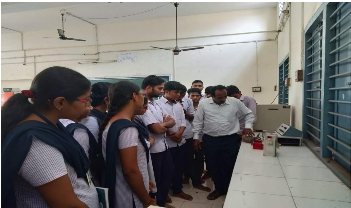
Students learning about the use of various instruments for conducting biotechnology experiments